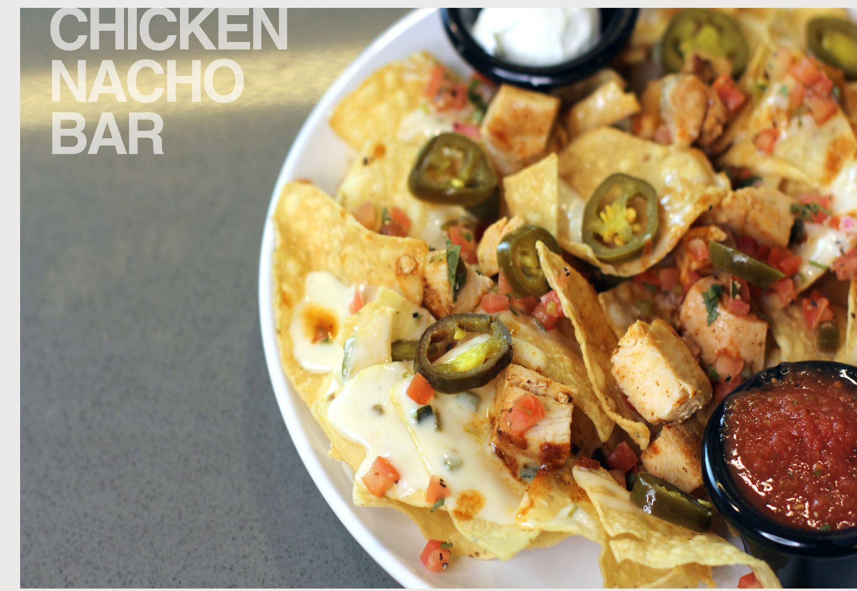
CHICKEN NACHO BAR

Served with lettuce, tomatoes, olives, jalapeños, onions, sour cream, plus queso and salsa. Corn tortilla chips.