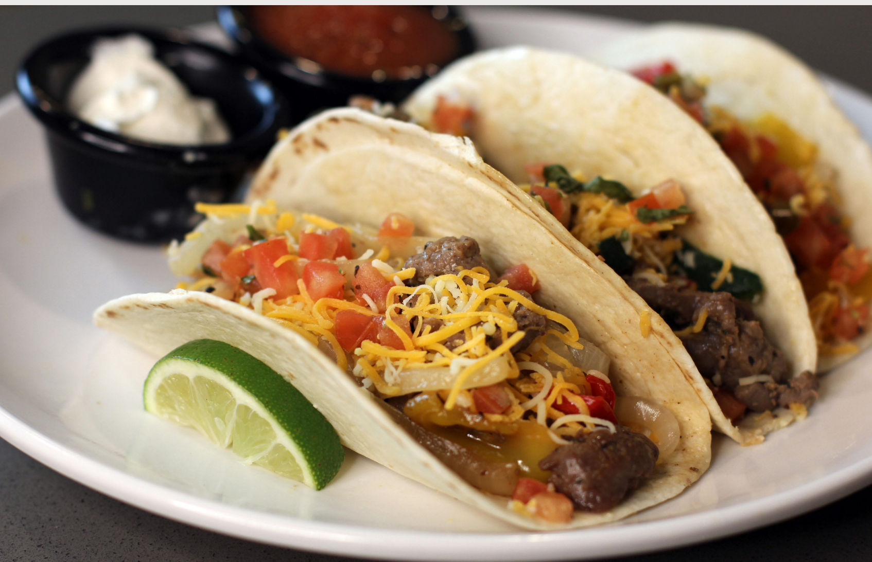
STEAK FAJITA BAR

Order minimum of 10 people per item. Complimentary water and tea - coffee upon request.