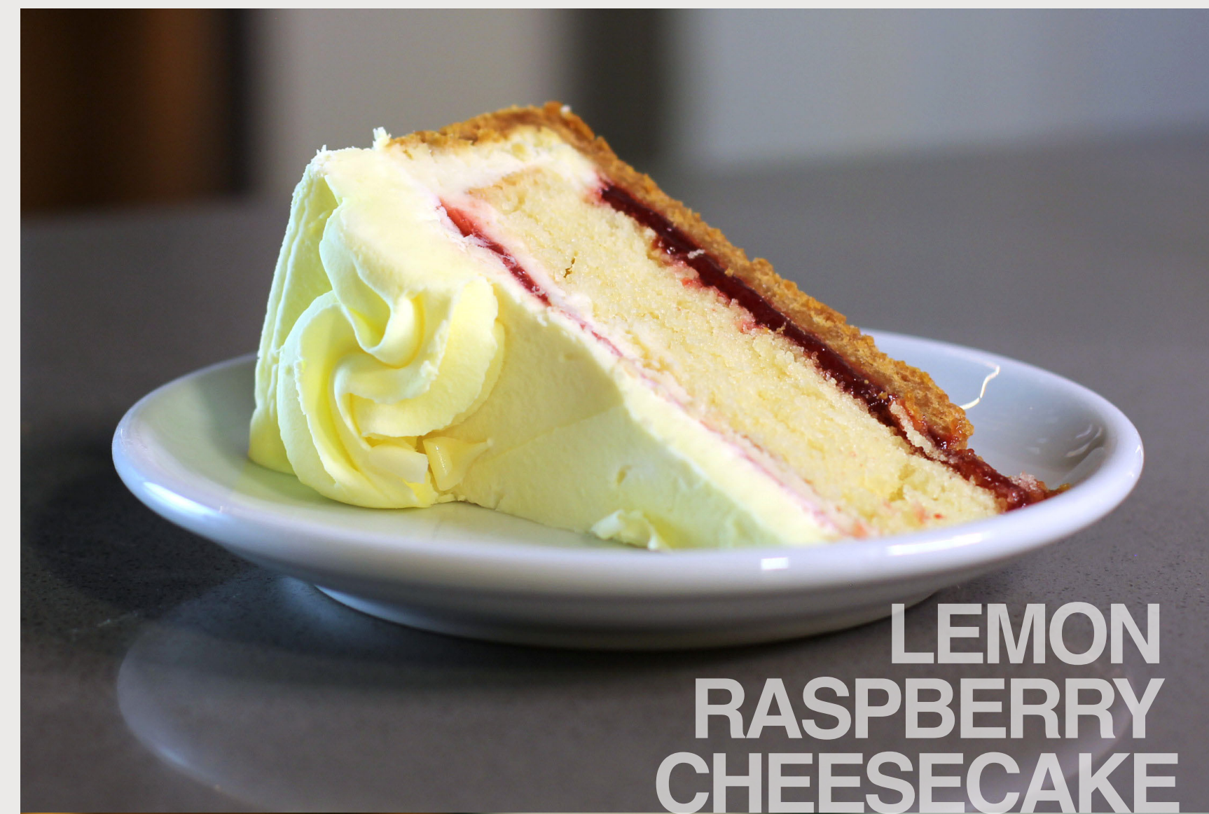
LEMON RASPBERRY CHEESECAKE