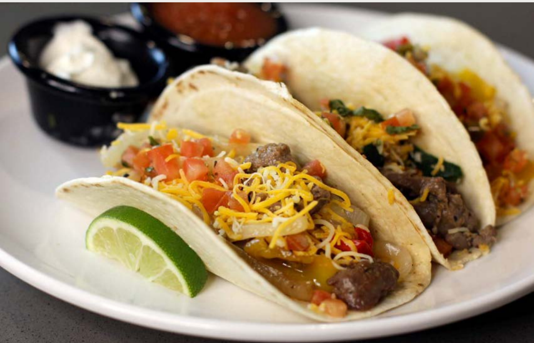
STEAK FAJITA BAR

Corn tortilla chips served with queso, lettuce, tomatoes, jalapeños, onions, sour cream, and salsa.