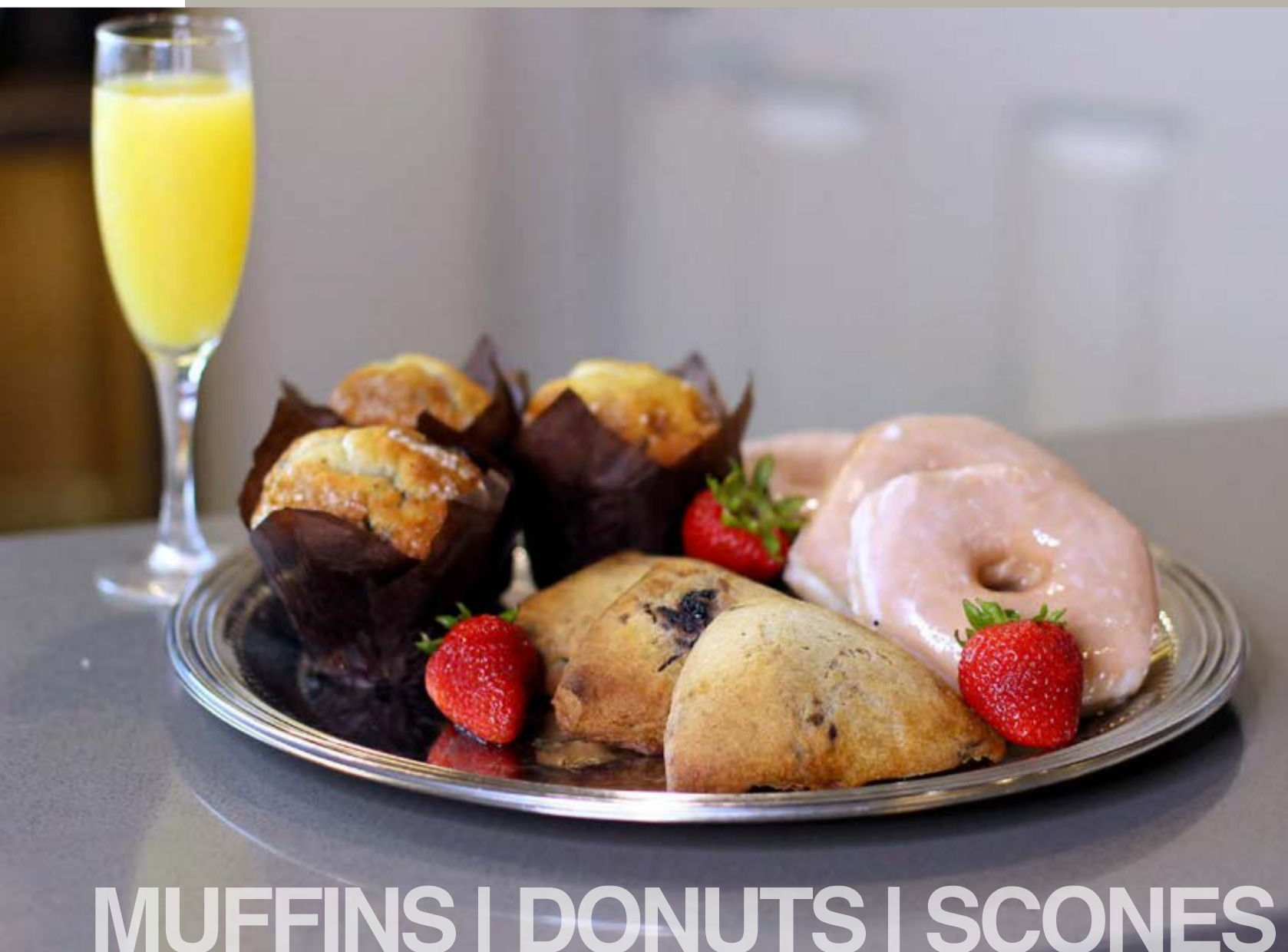
MUFFINS | DONUTS | SCONES