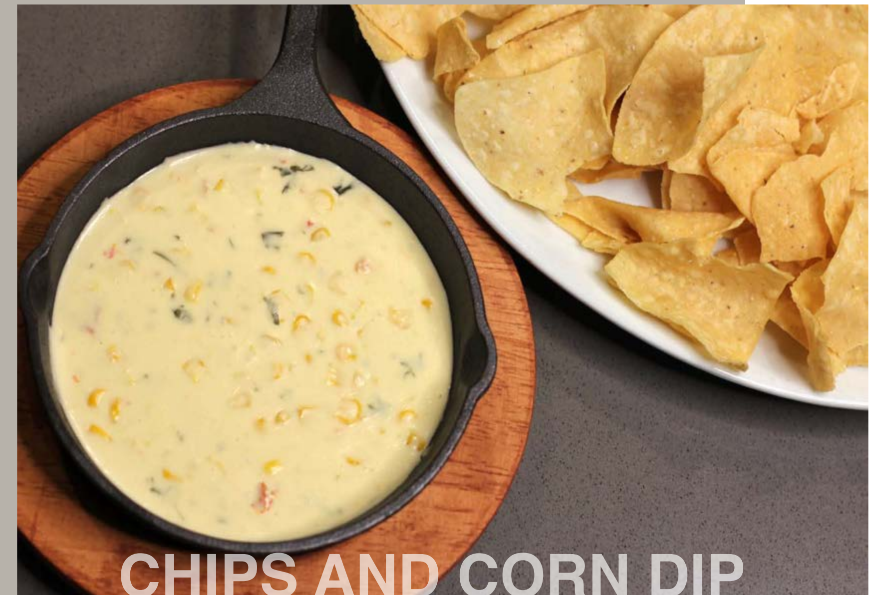
CHIPS AND CORN DIP

Chips and Jalapeño Popper Dip | 5 per person Fresh tortilla chips with our house-made Jalapeno Popper Cheese Dip