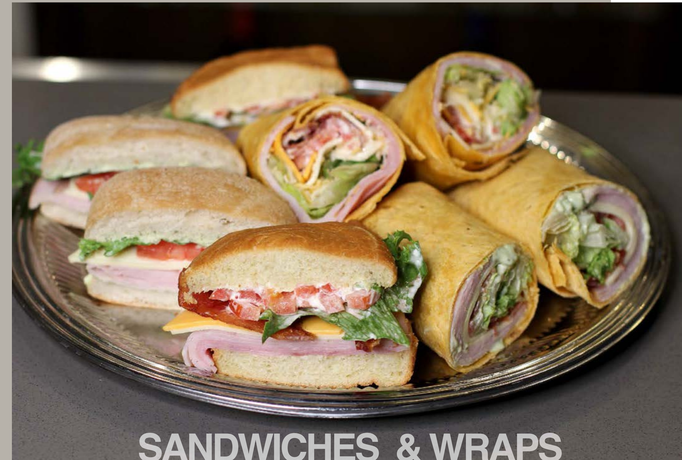
SANDWICHES & WRAPS

Served on ciabatta, croissant, or jalapeño cheddar wrap.